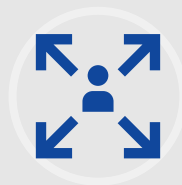
TRANSFORMATIONAL EXPERIENCES AND RETREAT DESIGN